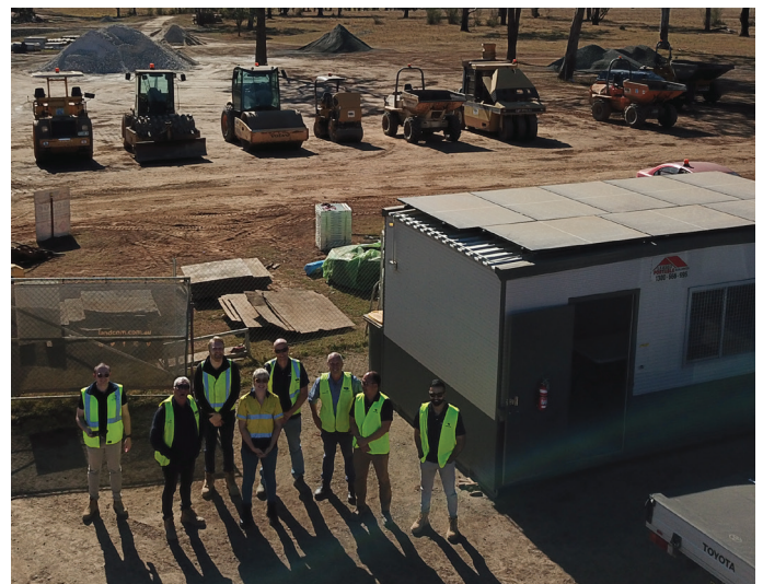
The team in front of the new solar-powered sheds in North Wilton

Upcoming works include electrical, water, and NBN infrastructure, as well as an extension to