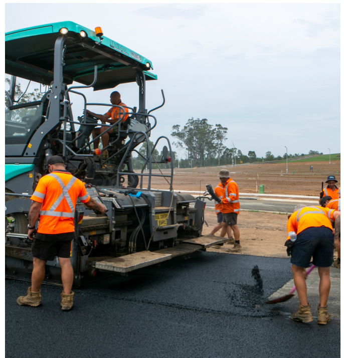
Crews lay PakPave asphalt across Fairway Drive.

The bridge will remain the main access point into North Wilton until the new Hume Highway on and off ramps are built.