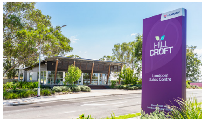
Hillcroft Sales Centre

New 'fit for purpose' social housing is also being delivered at Claymore to better meet future resident needs, with 27 homes being delivered in Stage 3. Sixteen of these homes were completed in June 2022, with the remaining 11 anticipated to be completed in October 2022. The design of new seniors living units is also underway.