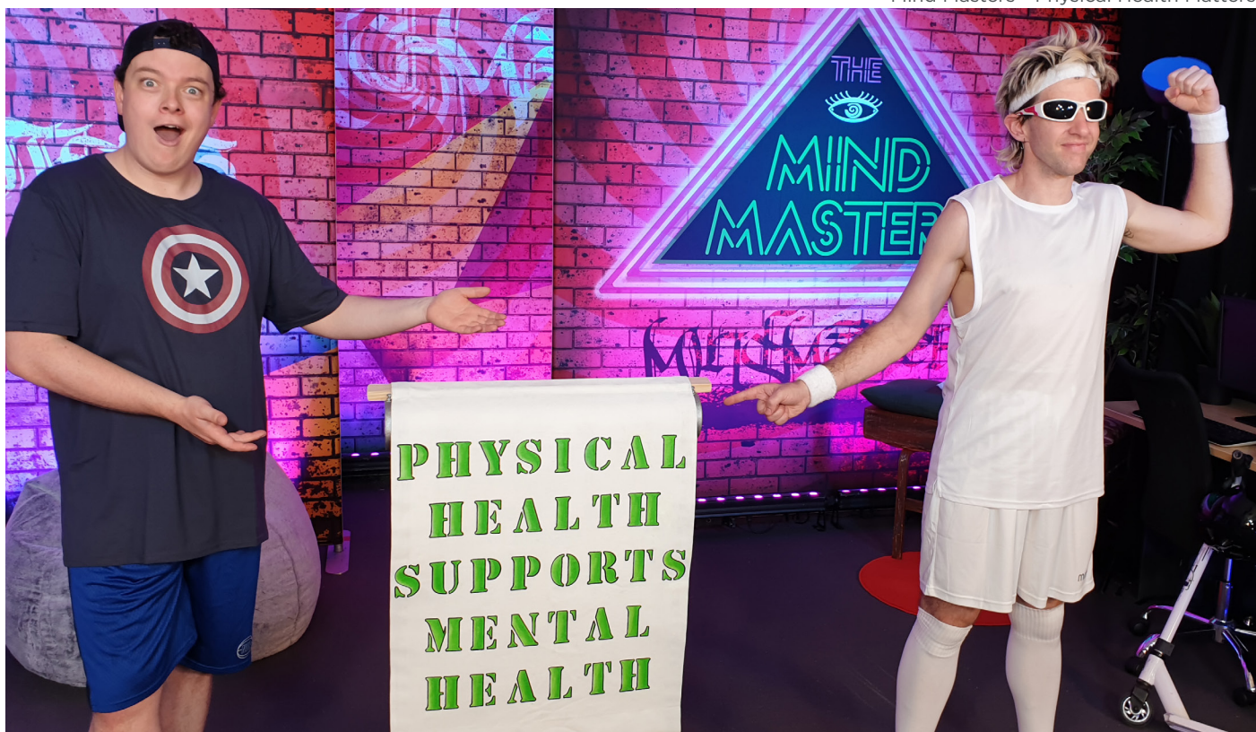
Mind Masters - Physical Health Matters

We received positive feedback from teachers about students enjoying the workshops. We are planning to roll out this program in primary schools later this year.