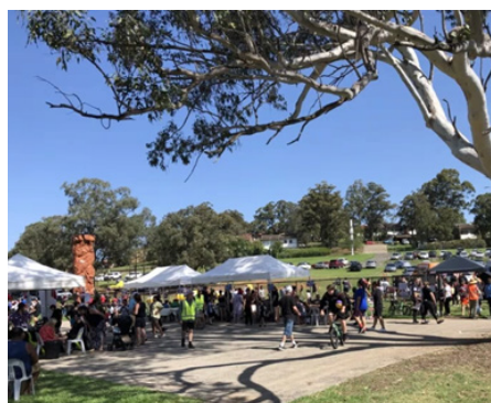
Claymore Summer Christmas