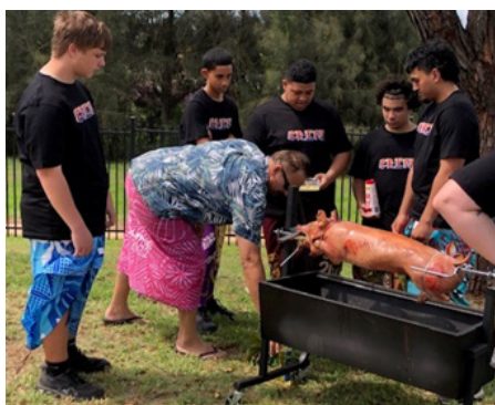
UMU Taste of the Pacific

Claymore residents got into the festive spirit at the Summer Christmas and the Senior's Luncheon events where there was lots of food, activities, entertainment and giveaways!