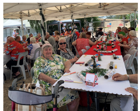
2023 Senior's Luncheon