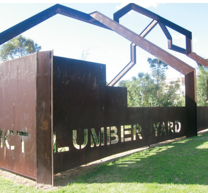
Convict Barracks Frame in Scott Street Newcastle commissioned by Newcastle City Council. This large steel sculpture represents the structure of the first convict industrial settlement site discovered in Newcastle.