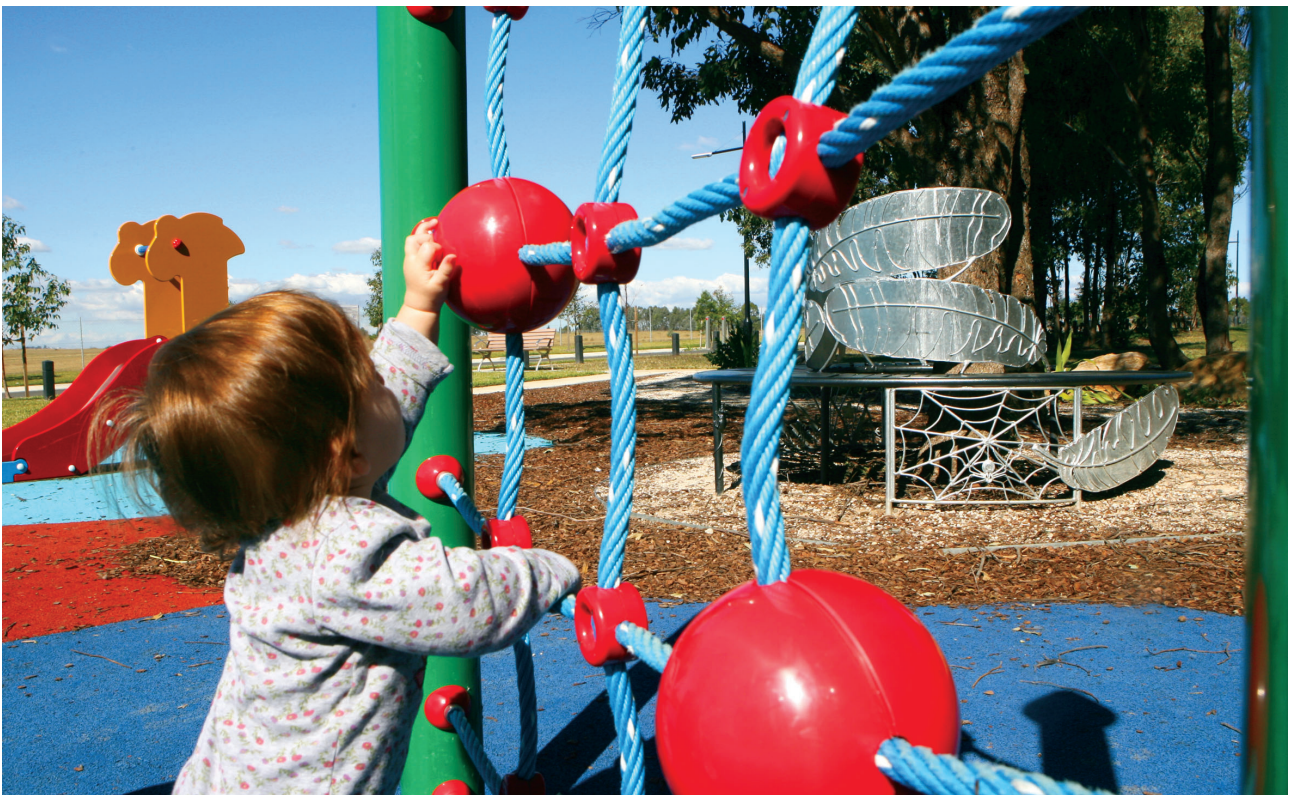
Owl seats at The Ponds by Art Is An Option.