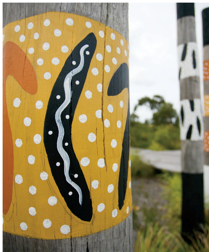
The meeting place poles (no name) by local Indigenous artist Mini Heath at Koala Bay in Tanilba Bay, Port Stephens. The sculptures are part of a series of artworks reflecting the cultural history of the site.