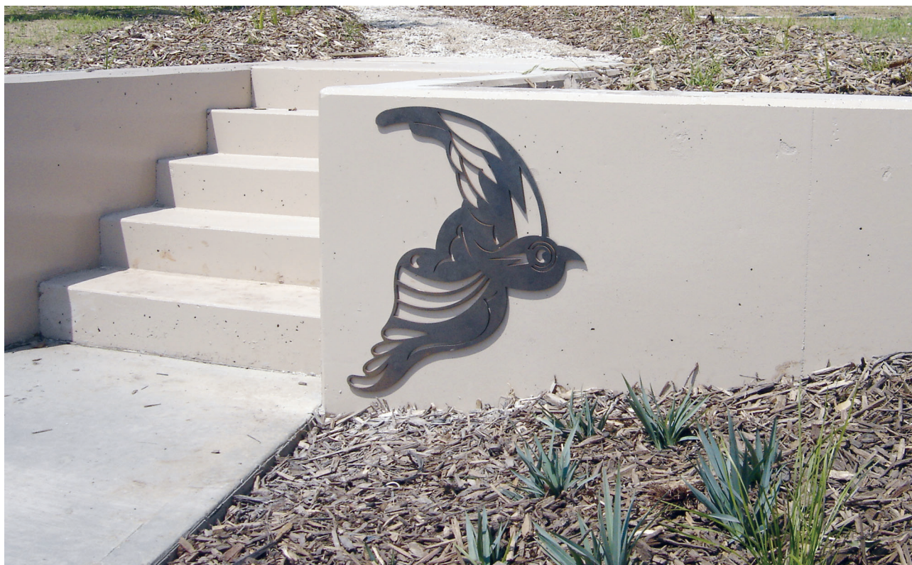
Justin Sayarath's Bird Flight marks the entry to a neighbourhood park at The Ponds. Public art need not be grand in scale and small artworks can give character to everyday places.