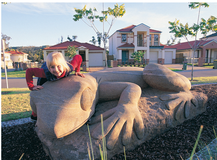
The Gecko is one of four stone sculptures by Ishi Buki at Worrell Park near Wyoming. The reptile theme of the neighbourhood park is a nod to the heritage of the site, the former home of Eric Worrell's Australian Reptile Park.

"Art is an expression of the creative spirit, of our endless capacity to see the world with wit and imagination, to be innovative with materials and technologies and to provide an engaging commentary on the times and places in which we live" (M. Guppy). Creativity is also a powerful tool for community life and may be used to address community issues in a flexible and inclusive way. Successful public art is not only a reminder of the value of creative thinking but affirms its place in everyday life.