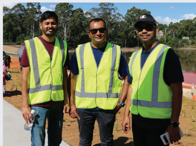
Macarthur Heights Community Planting Day