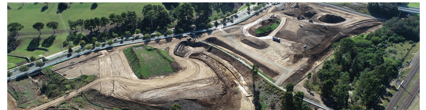
Macarthur Gardens North under construction - April 2024

Please refer to the map below for more information.