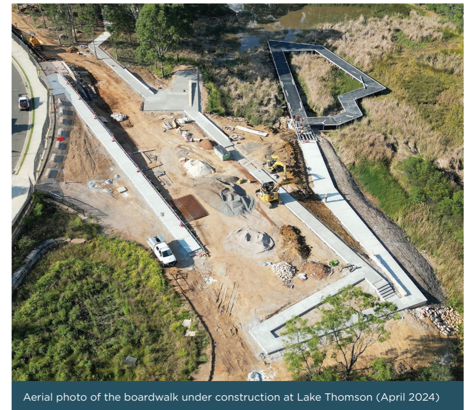
Aerial photo of the boardwalk under construction at Lake Thomson (April 2024)

The delivery of the sportsfields precinct and the Macarthur Regional Recreational Trail are due to commence work later this year. The regeneration of bushland areas along creek corridors has commenced and are progressing well.