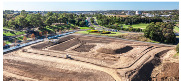
Macarthur Gardens North under construction

Bulk earthworks continue onsite with rollers, scrapers, excavators and dump trucks busy levelling and stabilising the site. Trucks continue to transport soil on and off site. Over the last few months, we successfully re-aligned the pedestrian path that crosses through the site to maintain pedestrian access. Civil works have begun to build the new roads, install services and construct the new fitness park and central park. Both civil works and bulk earthworks will continue throughout the year.