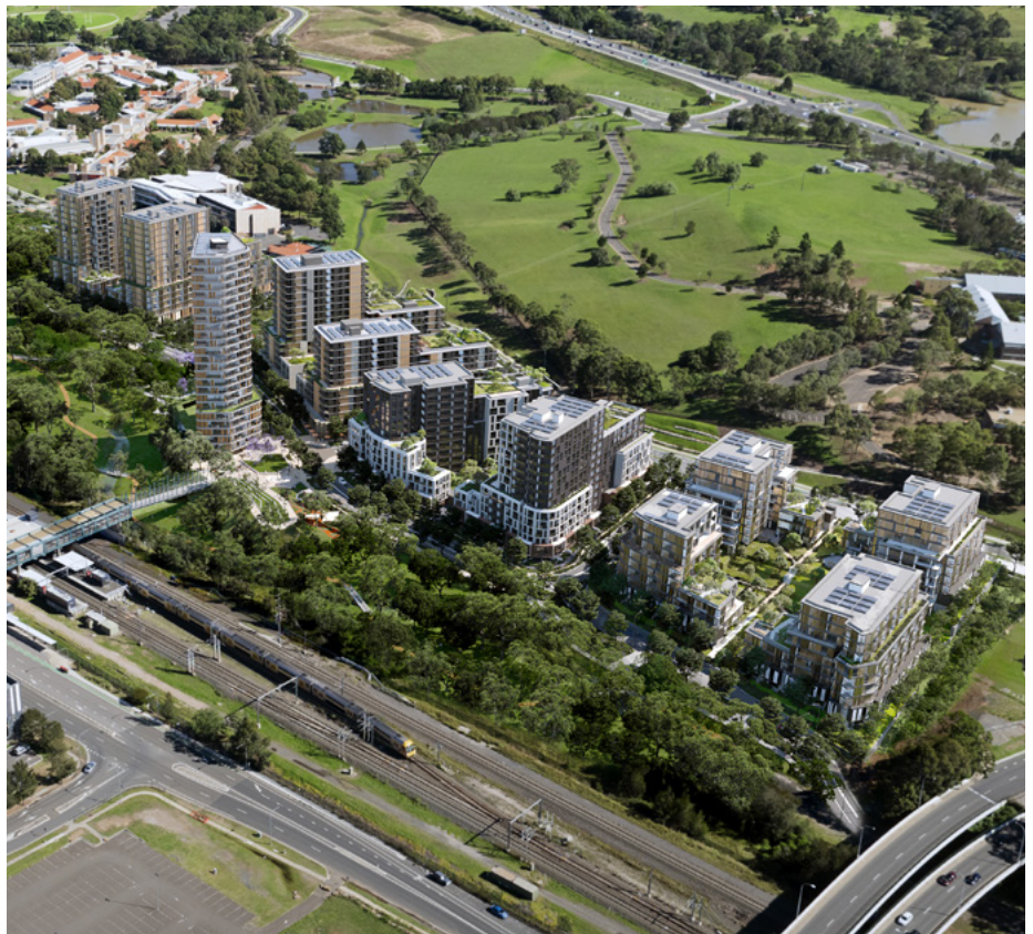
Indicative artist's impression of the proposed changes, subject to change and approvals

We are proposing to provide additional housing of various sizes, from studios to three-bedroom apartments, to cater to the diverse needs of the local community, including students, essential workers and families.