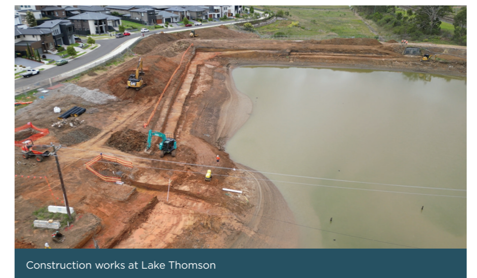
Construction works at Lake Thomson

These works are expected to take 12 months to complete.