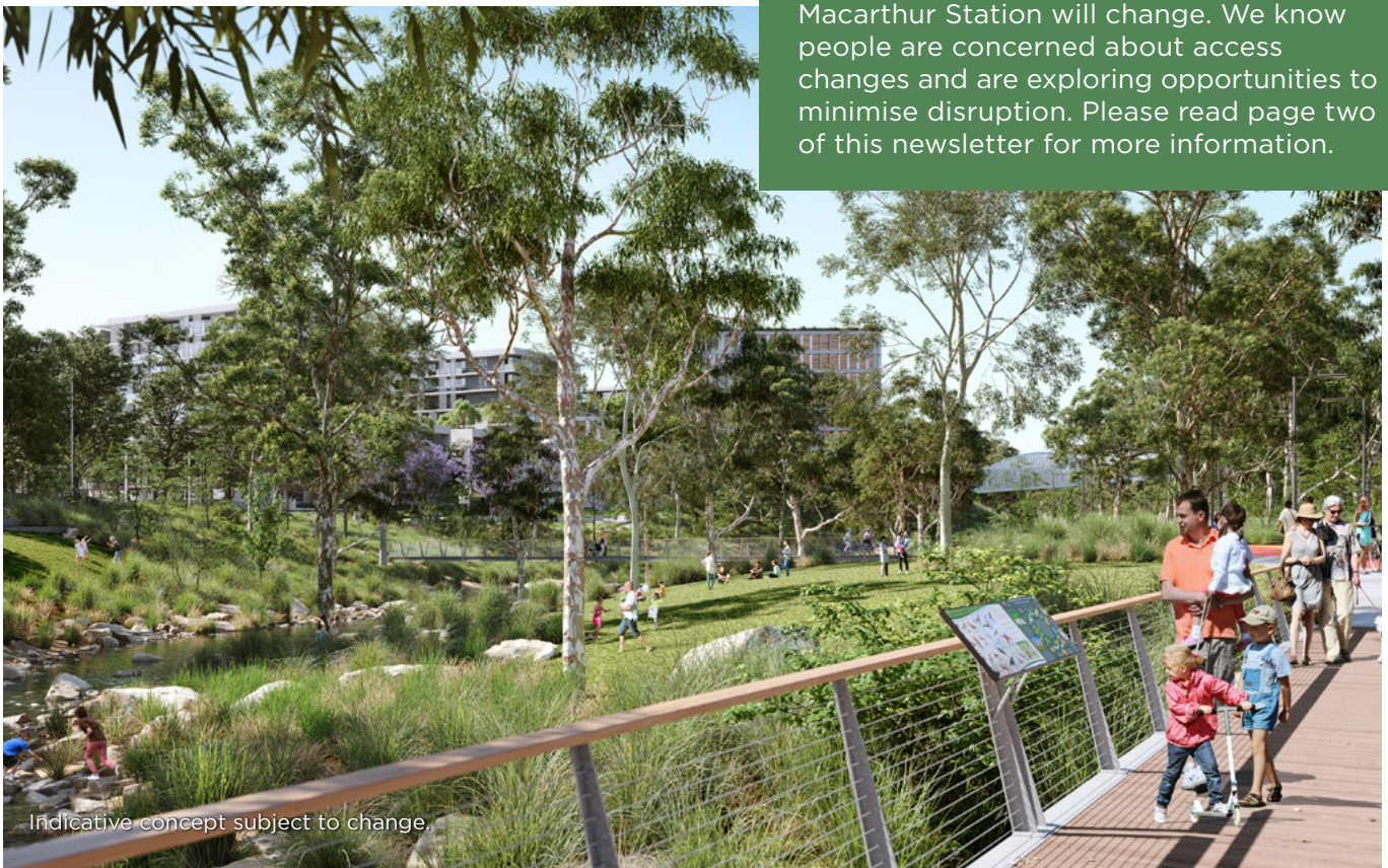
Indicative concept subject to change.

We are planning to start early construction at the Macarthur Gardens North site in the coming months. During early works, pedestrian access through the site to Macarthur Station will change. We know people are concerned about access changes and are exploring opportunities to minimise disruption. Please read page two of this newsletter for more information.