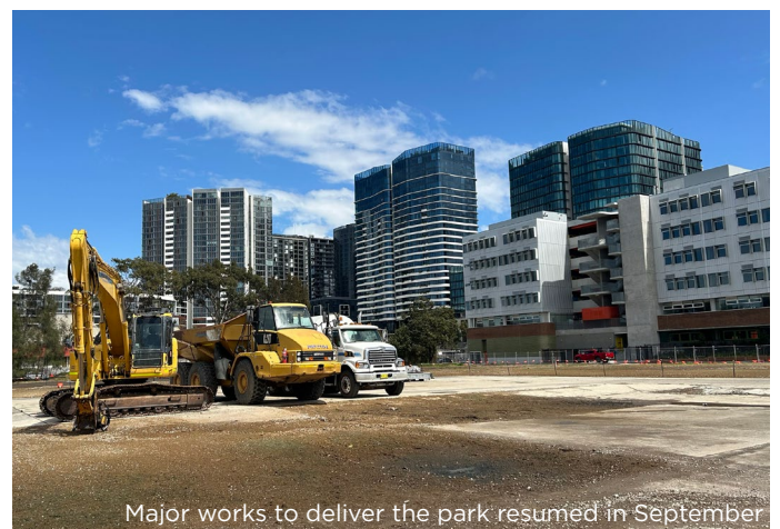
Major works to deliver the park resumed in September