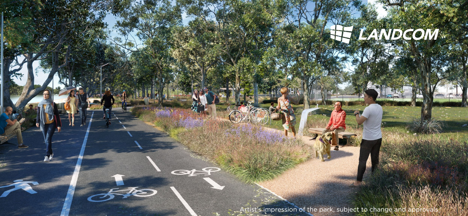
Artist's impression of the park, subject to change and approvals