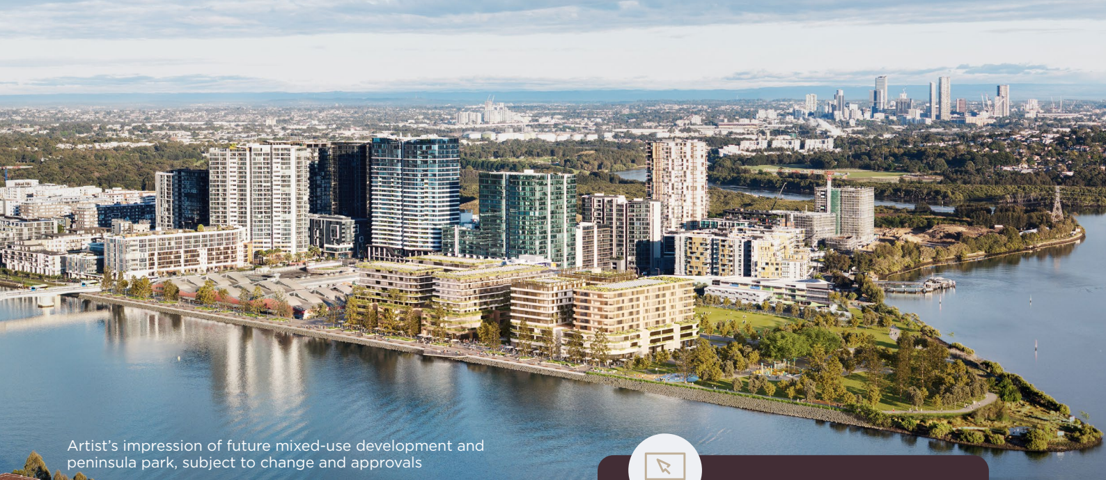
Artist's impression of future mixed-use development and peninsula park, subject to change and approvals